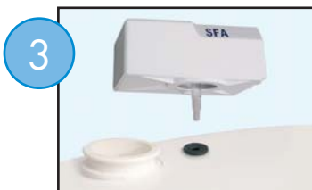
3 Insert the tube and position the Sanialarm on top.