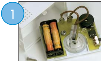
1 Install two AA batteries (not included)

* Suitable for use with Saniplus, Sanibest Pro, Sanipack, Sanigrind Pro and Sanivite