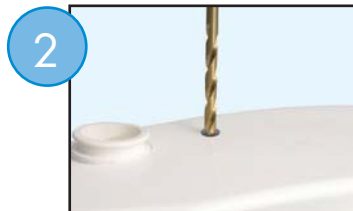
2 Drill a 3/8" diameter hole on top of the case where indicated.