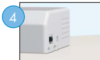
4 Turn the switch to the ON position.